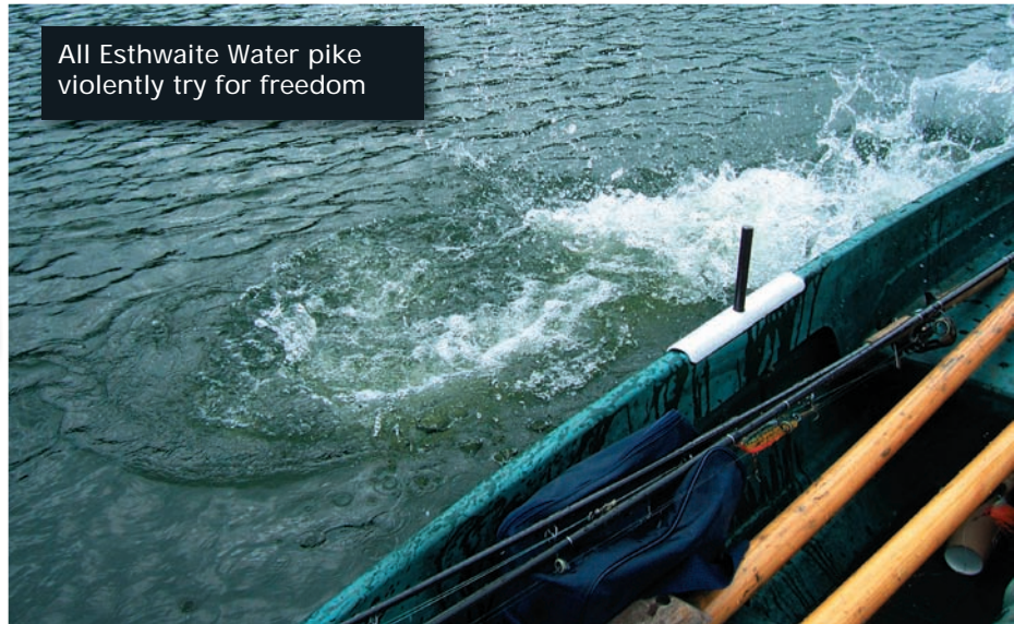
All Esthwaite Water pike violently try for freedom

two days were impressive accounting for a massive catch of pike which was approximately 1200lb of really good sized pike for the three of us, and amongst that catch there was a 20lb-plus for each of us.